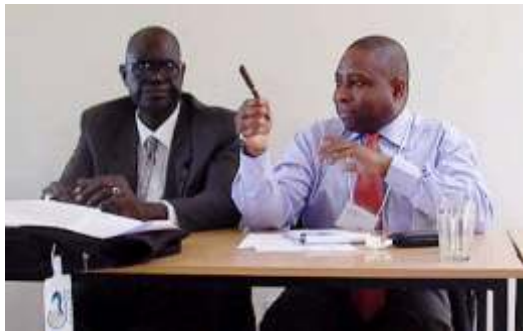
Delegates who were present at the African Leadership Seminar

The African Leadership Preparatory Committee, established on the occasion of Pacem in Maribus 2002, recognized the need to assist African countries in the implementation of the agreed plans of action contained within national frameworks, the African Process, the World Summit on Sustainable Development and NEPAD, especially in the area of ocean governance. The implementation of these commitments will be key in achieving sustainable development of oceans and coasts in Africa, and should be supported by all stakeholders. The African Leadership Preparatory Committee committed itself to establishing a process to contribute towards effective implementation of the agreed plans of action at regional and national levels through the development of an African Implementation Action Plan for Oceans and Coasts.