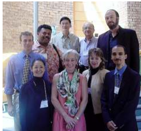
Delegates at PIM2002