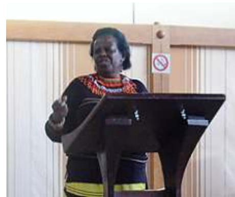
Hon. Rejoice Mabudafhasi at the PIM2002 Opening Ceremony